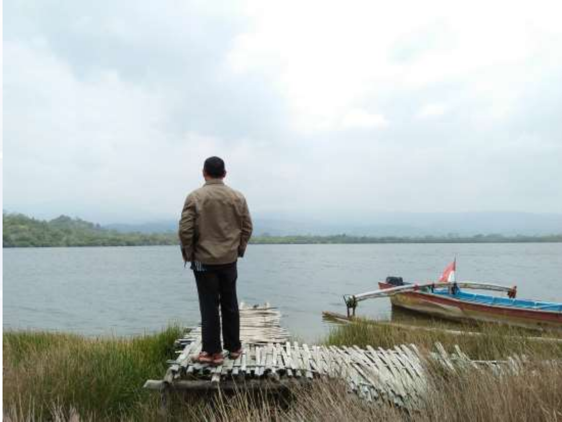
Asam Lake, Suoh, West Lampung

"Never lost hope, because it is the key to achieve all your dreams."